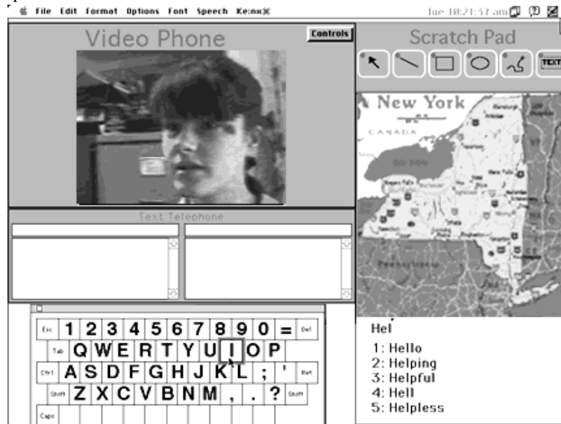
Figure 2 - Emulated Videophone with adaptations for subject E

chin. The roller ball was equipped with two buttons. The left hand one was configured to act as a conventional button and the right hand one was configured to stay “down” when it was used, allowing screen elements to be dragged. Typing was provided by adding an on-screen keyboard. Items on the keyboard were selected by clicking the pointer on them. In order to improve speed and typing accuracy, text prediction was added. The layout of the interface for this user is shown in figure 2 below.